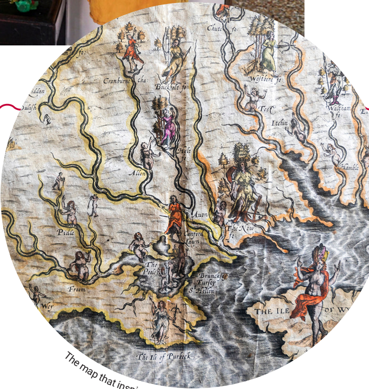
The map that inspired the Dorset Pavilion

This map is the inspiration for the Dorset Pavilion. Found at an auction house – the site of so many local treasures as they change hands and pass down through generations – it was originally created in 1622, to illustrate Poly-Olbion , a topographical poem describing Great Britain by Michael Drayton. It exquisitely captures the playfulness of the land: the map is almost empty, except for trees, ancient names, a person scything, several frolicking river nymphs, and extraordinary hills that drift to the sea. Welcome to Dorset-shere!